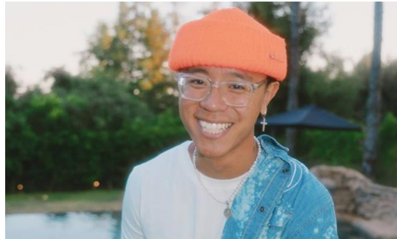
Michael Le 19 years old 34 million followers $1 million annually