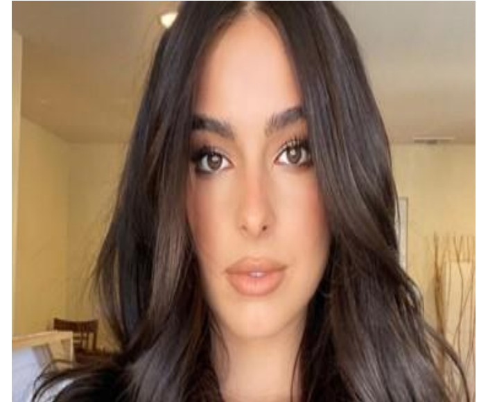
Addison Rae 19 years old 50 million followers $5 million annually