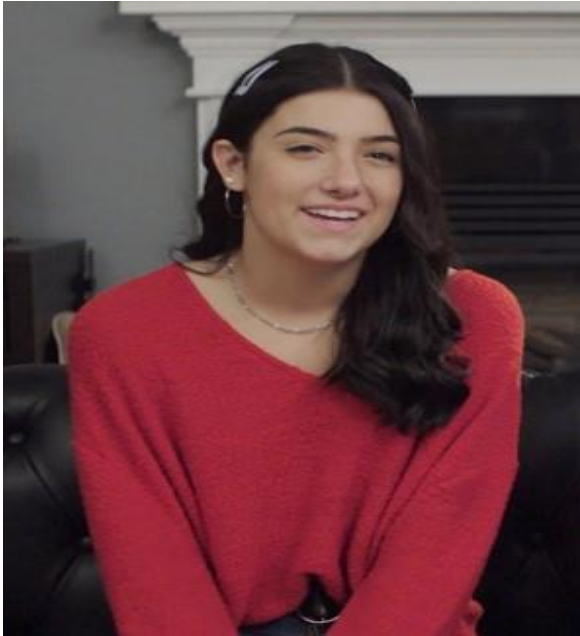
Charli D'Amelio 16 years old 83 million followers $4 million annually